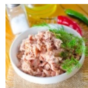
How to reduce sodium and keep the taste New Sodium Reduction Application for Canned Fish... Read more >