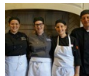
Kellogg school of management research showed umami Mediterranean is effective in replacing salt... Read more >