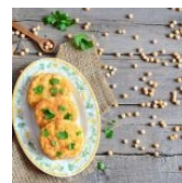
Less Sodium for Plant Based Meat Analogs – Vegetarian Meat Alternatives... Read more >