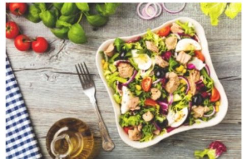
What is Umami? What is the definition of umami? and What is the relation between Salt, Salt reduction and Umami?... Read more

Find out how easy it is to develop or extend your brand portfolio with high quality, versatile Salt of the